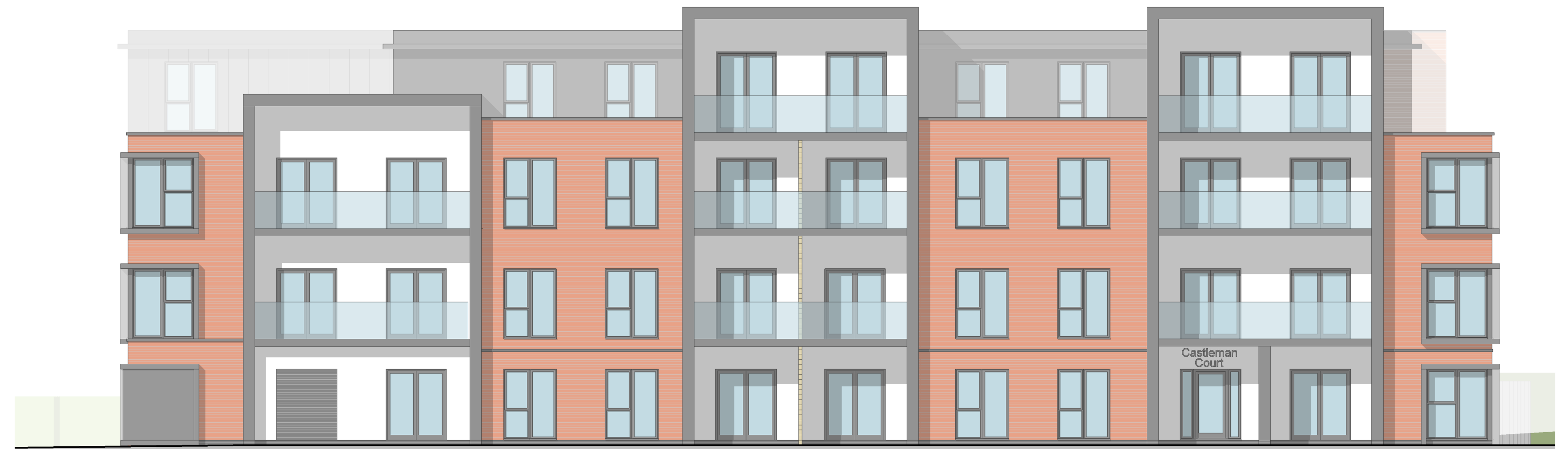
North West Elevation (Front)