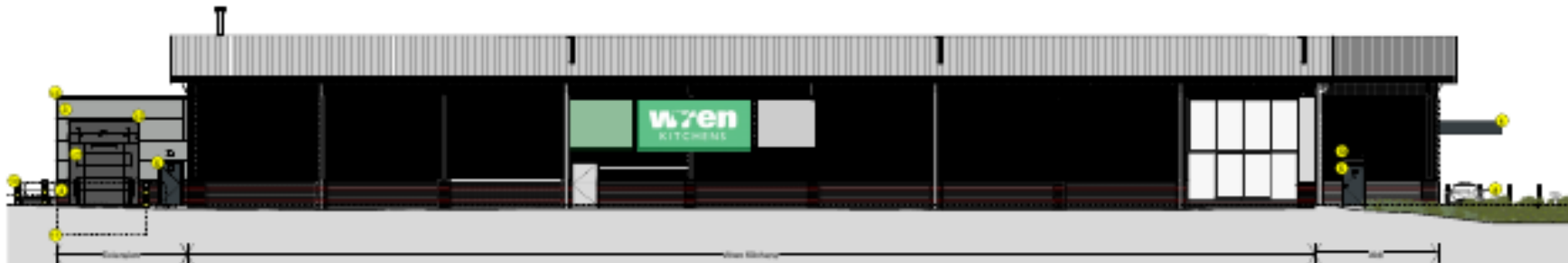
Proposed W7en Elevation

Note: Materials are preliminary and subject to change.