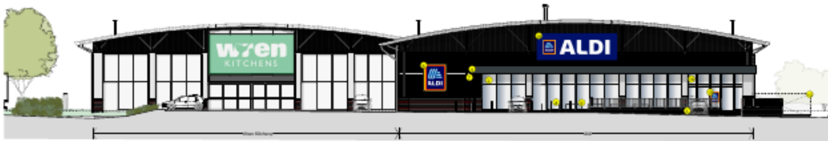
Proposed Storefront Elevation

Note: Materials are preliminary and subject to change.