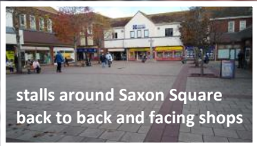
stalls around Saxon Square back to back and facing shops