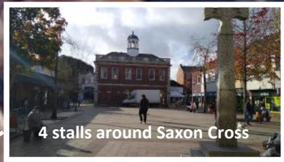
4 stalls around Saxon Cross