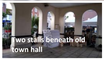
Two stalls beneath old town hall