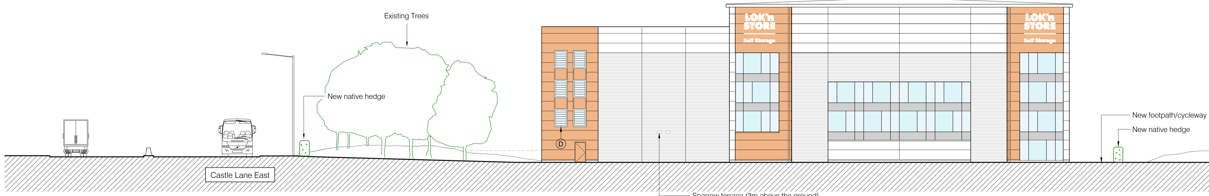
Elevation 4 (South East)