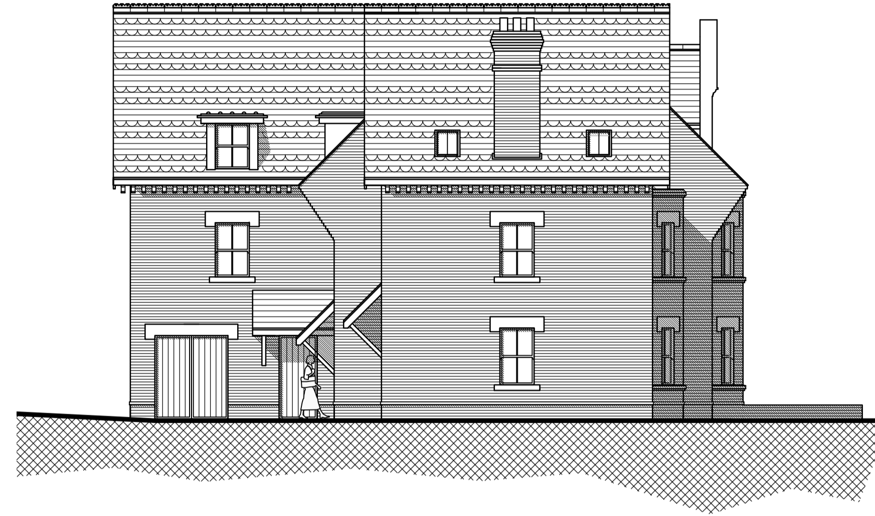
WEST ELEVATION SCALE 1:100