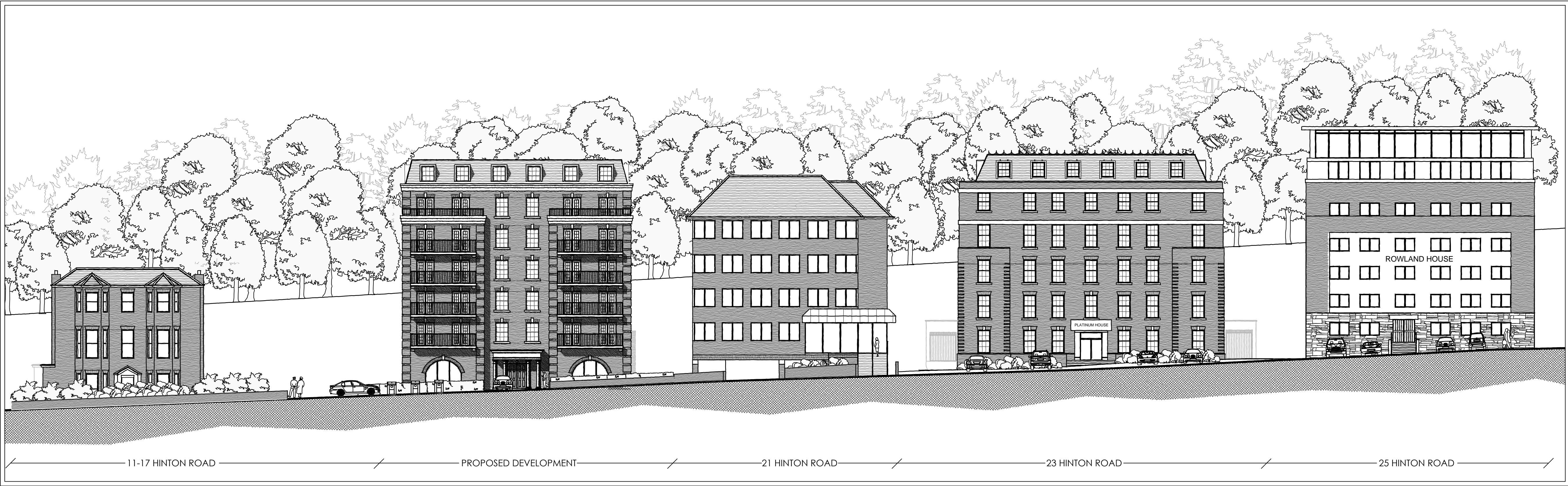
INDICATIVE STREET SCENE SCALE 1:200