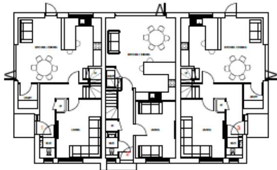
PROPOSED GROUND FLOOR PLAN SCALE 1:100