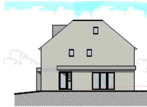
PROPOSED SIDE SOUTH EAST ELEVATION SCALE 1:100