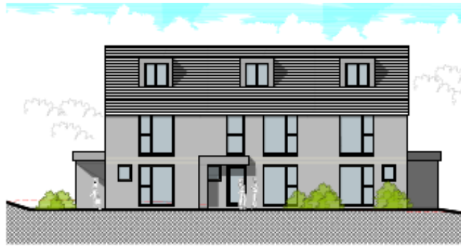
PROPOSED FRONT SOUTH WEST ELEVATION SCALE 1:100