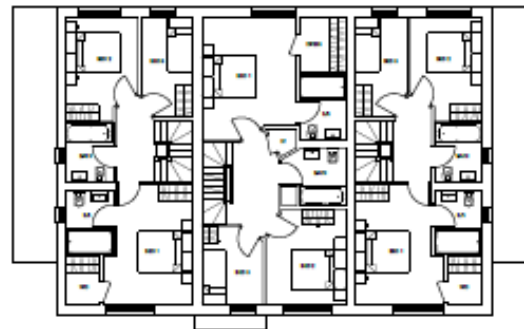
PROPOSED FIRST FLOOR PLAN SCALE 1:100