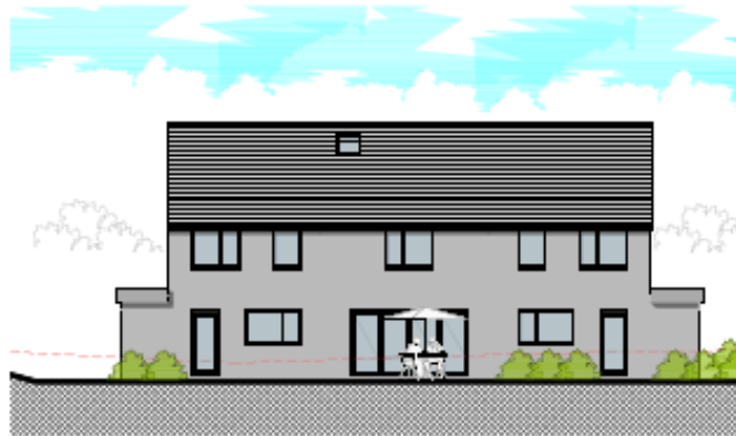
PROPOSED REAR NORTH EAST ELEVATION SCALE 1:100