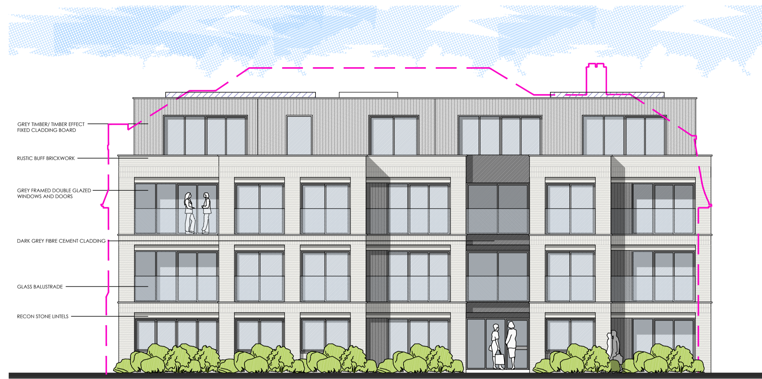
PROPOSED SOUTH ELEVATION SCALE 1:100