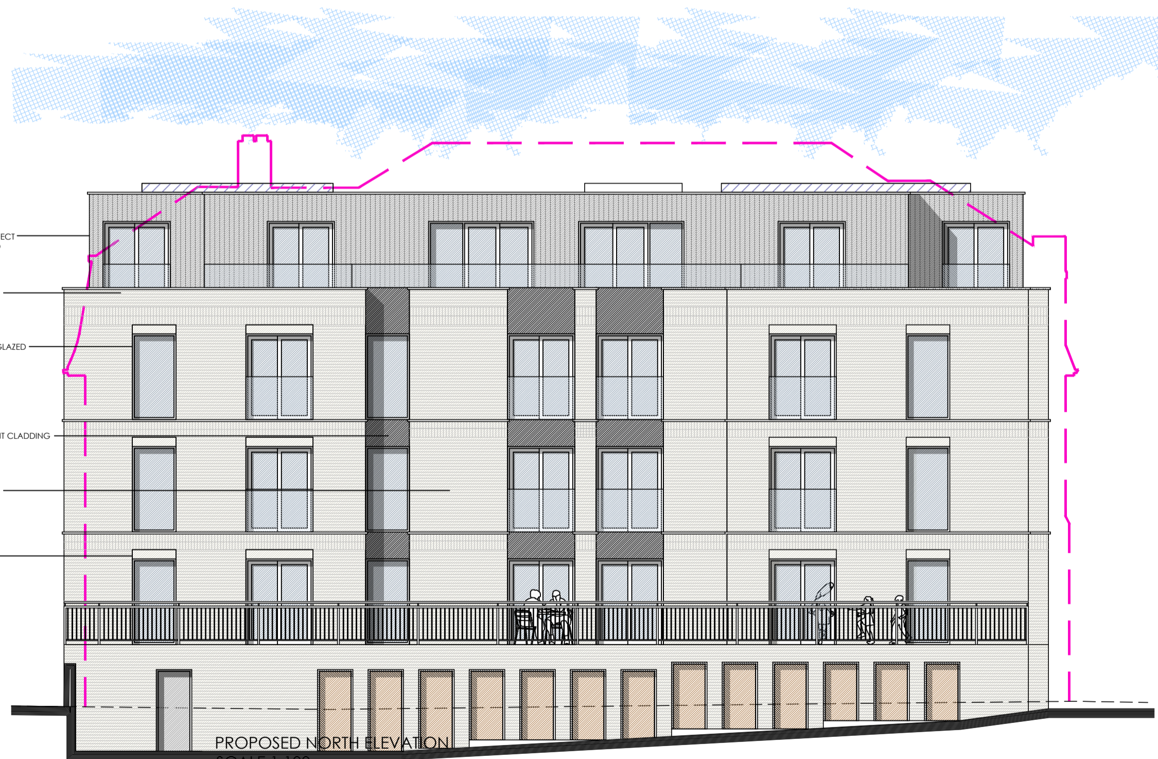
PROPOSED NORTH ELEVATION SCALE 1:100