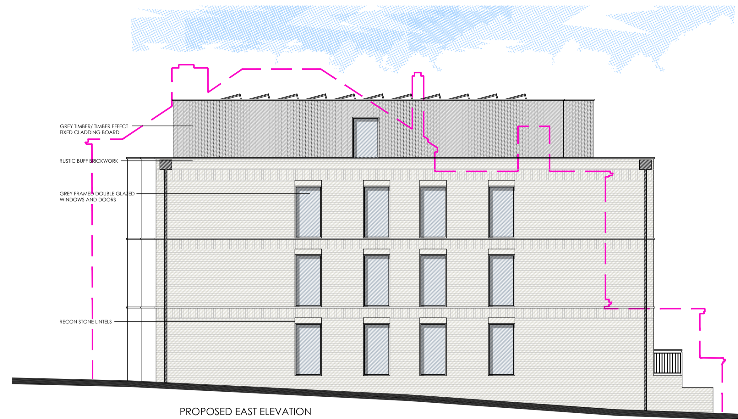
PROPOSED EAST ELEVATION SCALE 1:100