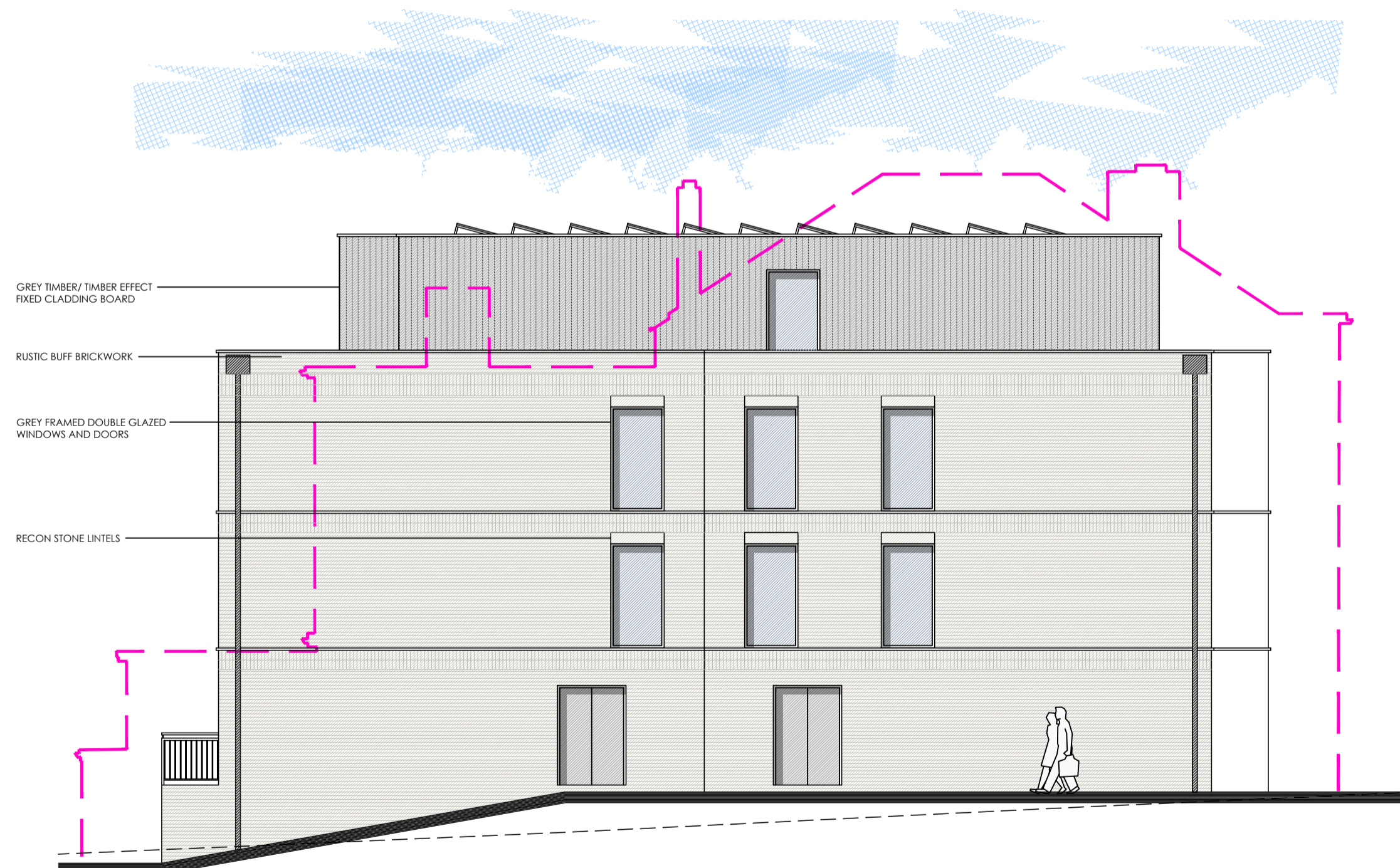
PROPOSED WEST ELEVATION SCALE 1:100