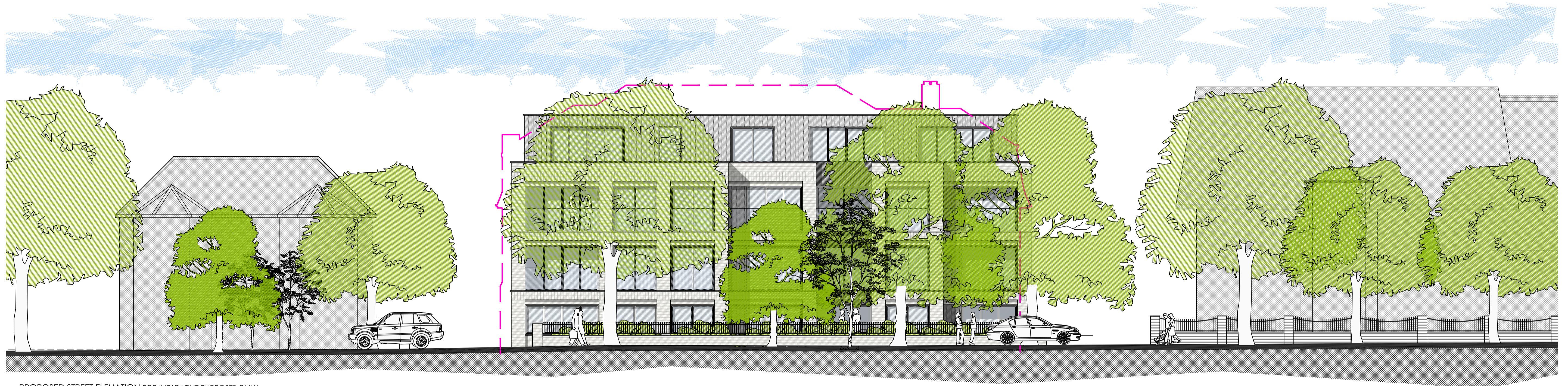
PROPOSED STREET ELEVATION FOR INDICATIVE PURPOSES ONLY SCALE 1:100