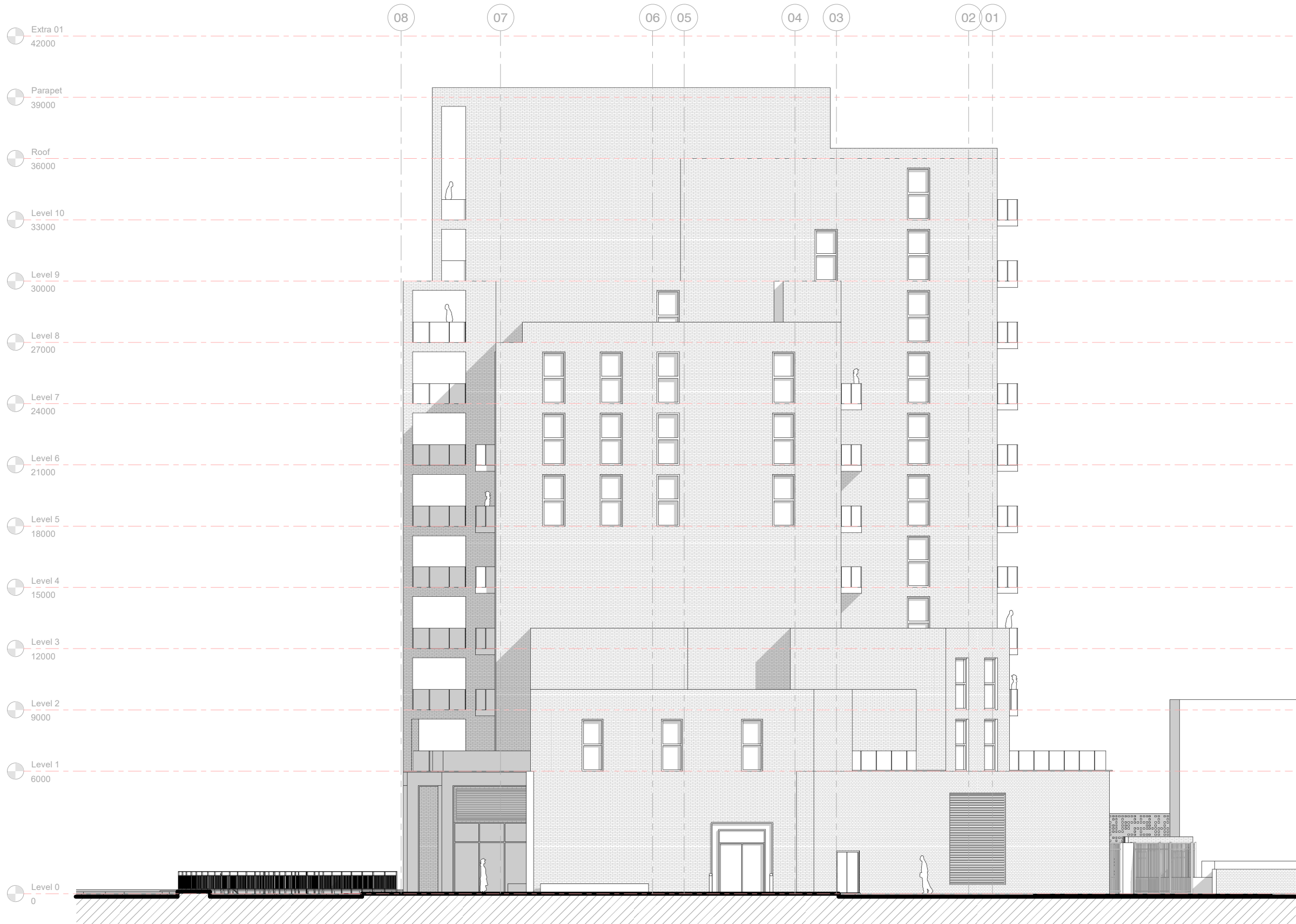
1 South Elevation 1 : 100