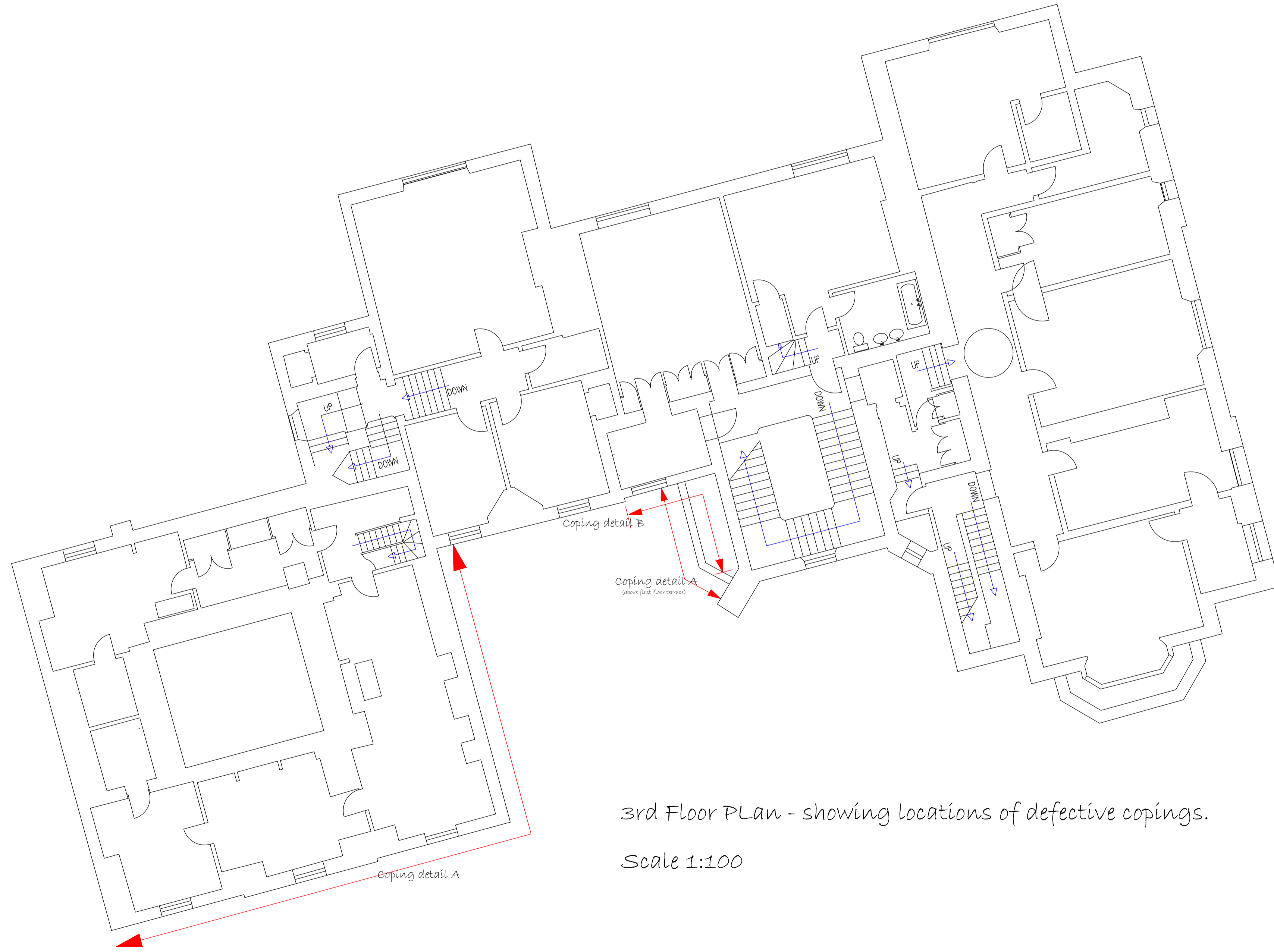
3rd Floor Plan - showing locations of defective copings.