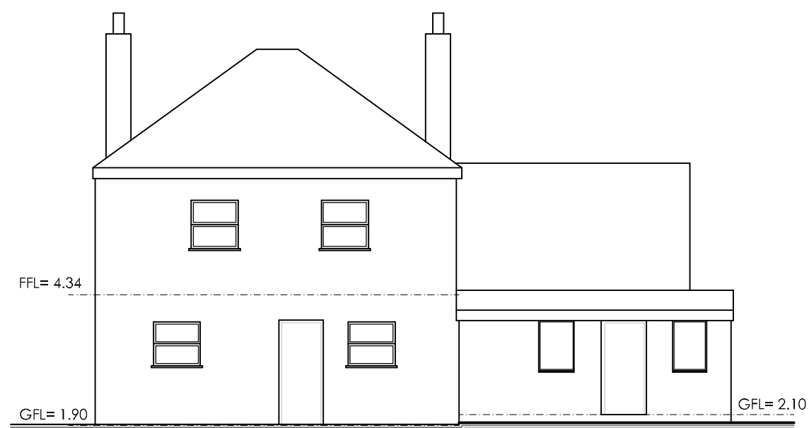
Rear (North West) Elevation