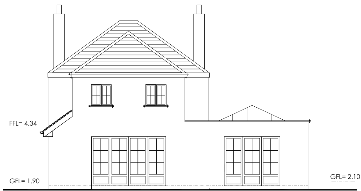
Rear (North West) Elevation