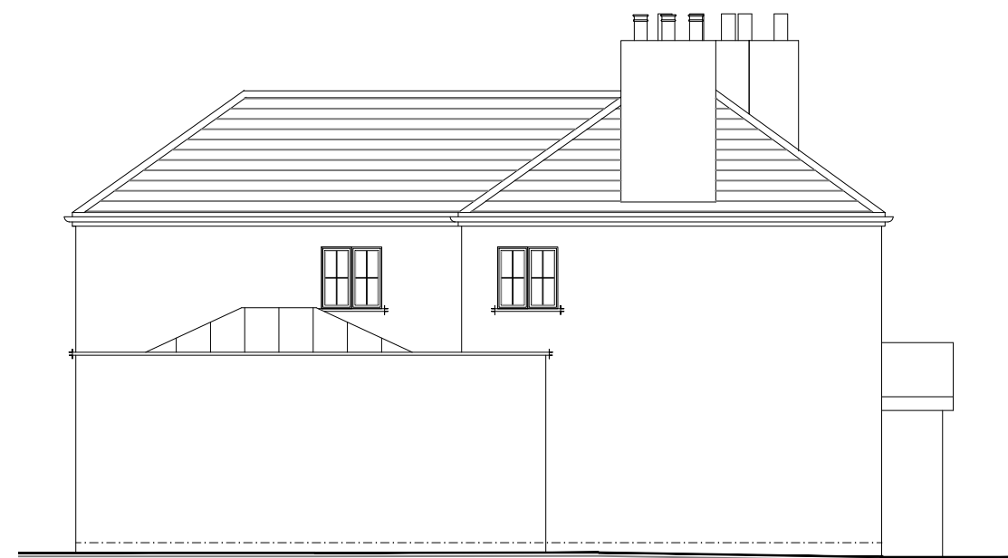
Side (South West) Elevation