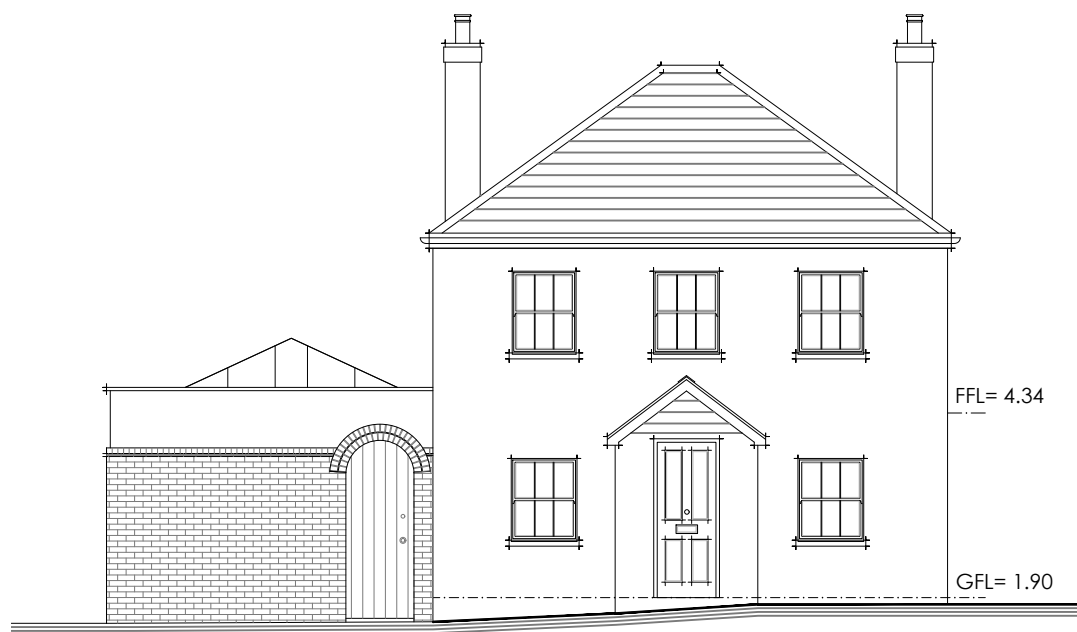
Front (South East) Elevation