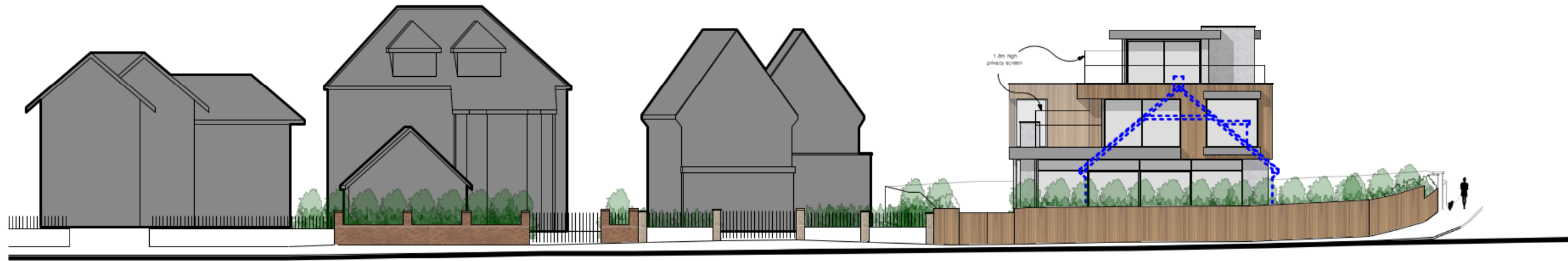
Indicative Streetscene (Bodley Road) Scale 1:250 @A3