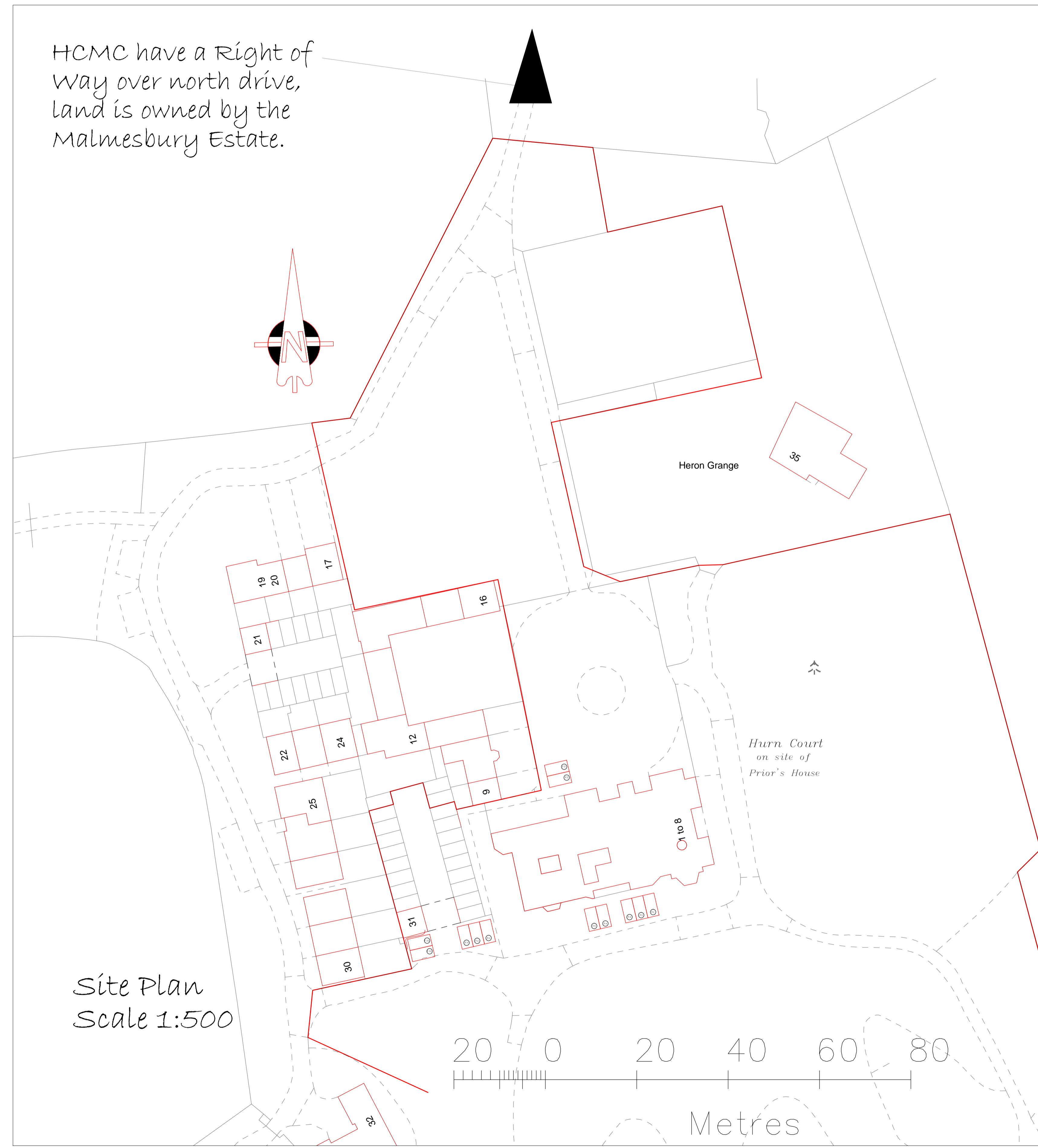
Site Plan Scale 1:500

HCMC have a Right of Way over north drive, land is owned by the Malmesbury Estate.