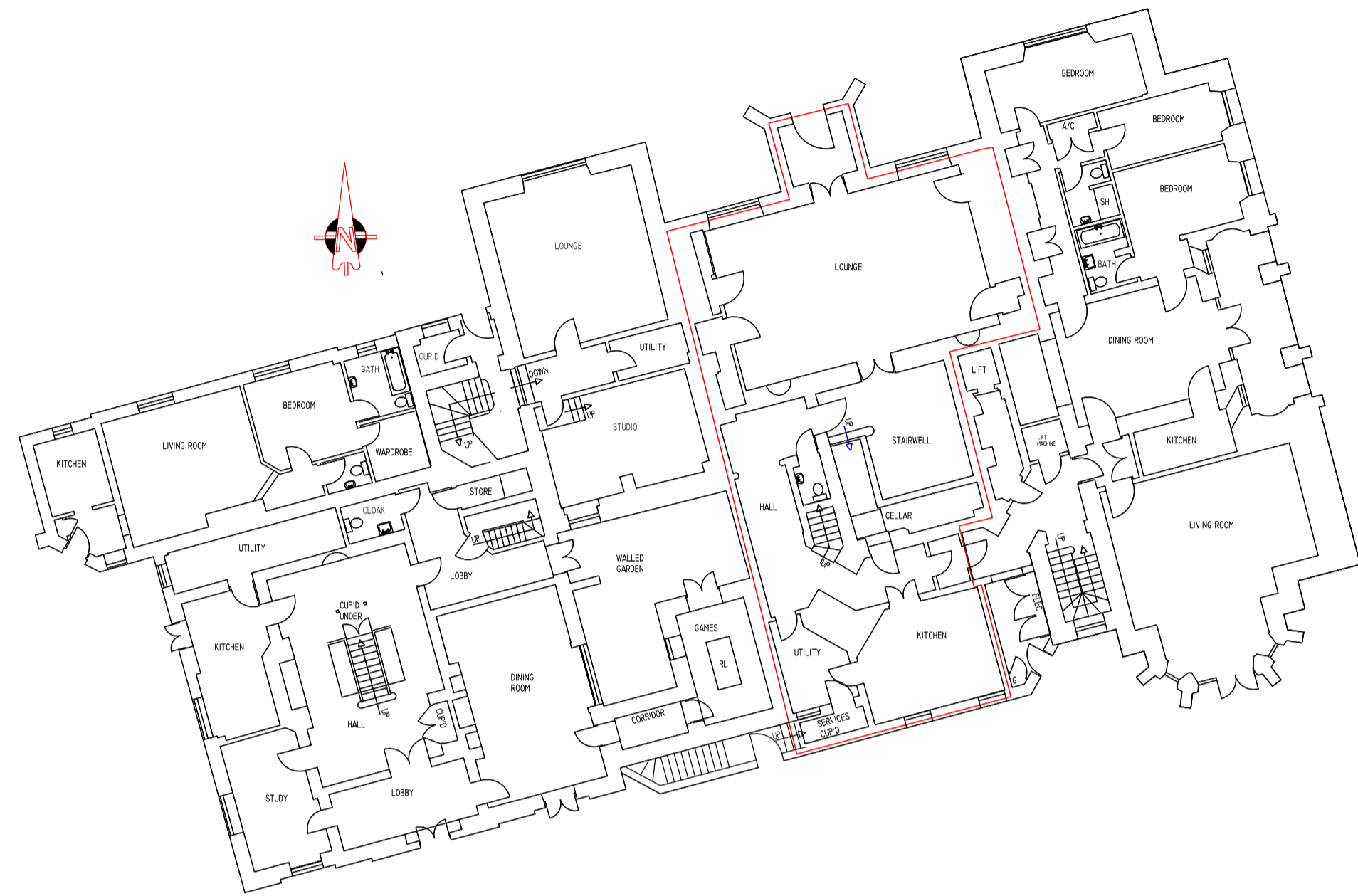
Ground Floor Plan Scale 1:200 (as printed @ A1 size)

Red line denotes the demise of flat 1 - taken down the approximate centre line of the party walls.