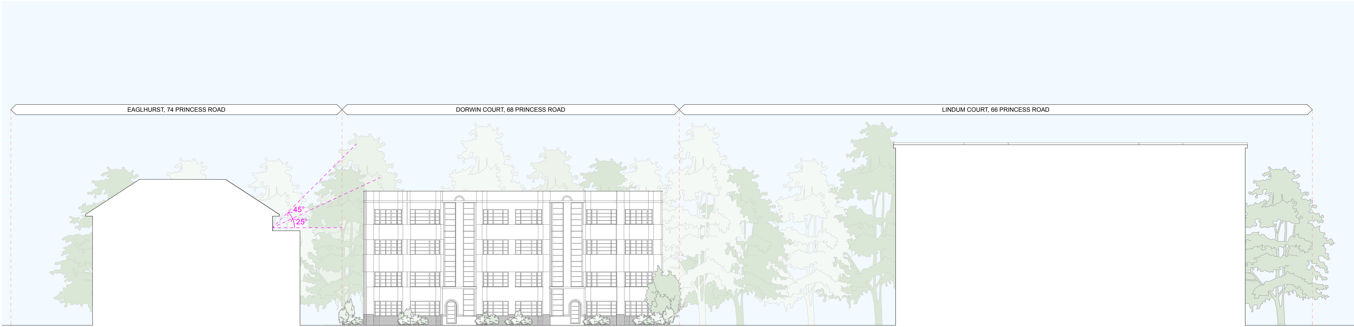
PRINCESS ROAD STREET ELEVATION Scale (A1): 1:200