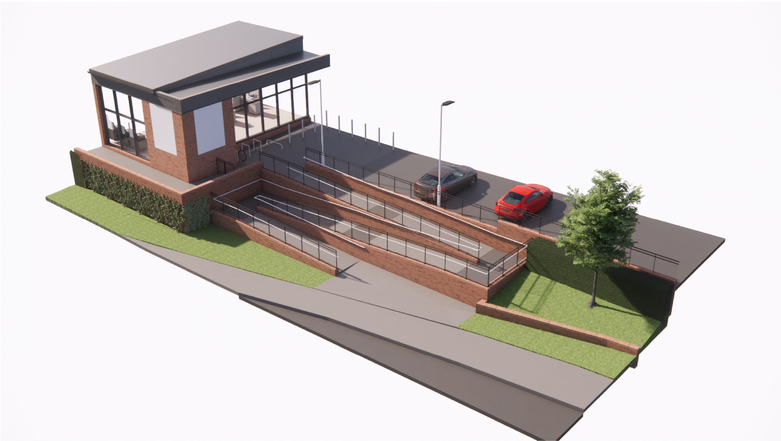
3D - Ramp